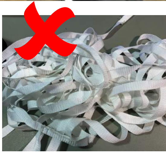
Please ensure all tethers are rolled up with a rubber band